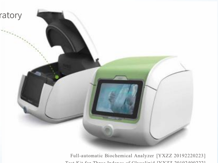
Full-automatic Biochemical Analyzer [YXZZ 20192220223] Test Kit for Three Indexes of Glycolipid [YXZZ 20192400222]

With the full-automatic biochemical analyzer which combines biological chip platform technology and biochemical detection technology, trace amount of detection reagent is encapsulated in a disposable small micro-fluidic chip through special freeze-drying process. It is capable of testing and recording of a variety of biochemical indexes with only one drop of blood, as well as statistical analysis and long-term tracking of the test data.